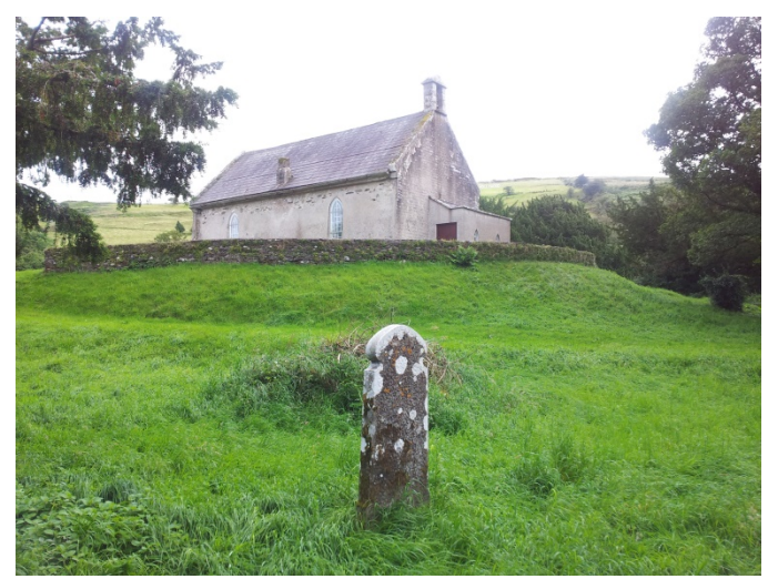
St. Kevin's Church, Hollywood

St. Kevin's is a 17th Century church and has long been a "Pilgrim Church" where pilgrims would have received a blessing as they made their way to Glendalough on the ancient pilgrim routes over the Wicklow Gap.