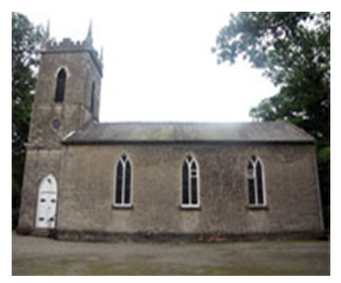
St. John' Church, Laragh

Glendalough and Laragh are in the ancient parish of Derralossary which is on record from at least the thirteenth century. In the year 1843 a Subscription was opened by the parish to fund the building of 'the new church in Laragh'. It was to be a Chapel of Ease, for the convenience, or ease, of the parishioners within its immediate vicinity. St. John's was not dedicated until 1867. The bell in the tower, was cast in 1872, 5 years after the church was dedicated. St. John's is no longer a Chapel of Ease, but is part of Rathdrum parish.