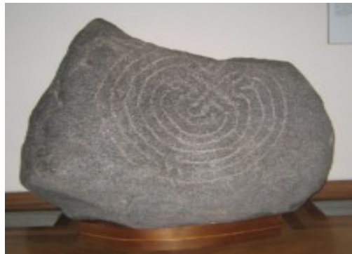
Hollywood Labyrinth Stone, Glendalough Heritage Centre

From St. Kevin's Hollywood you proceed on your pilgrimage to Glendalough along the R756. After three miles or so, the road is joined by the R758, which follows an alternative pilgrim route beginning at Valleymount. It is worth noting that it was at this junction that the celebrated labyrinth stone was discovered in 1908. The stone was transferred to the National Museum in the 1930s and in more recent times was placed in the heritage centre in Glendalough, where it is worth taking the time to view it.