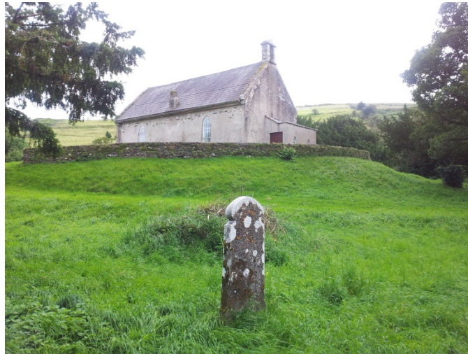
St. Kevin's Church, Hollywood

St. Kevin's is a 17th Century church and has long been a "Pilgrim Church" where pilgrims would have received a blessing as they made their way to Glendalough on the ancient pilgrim routes over the Wicklow Gap.