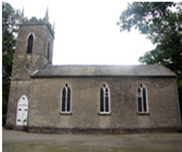
St. John' Church, Laragh

Glendalough and Laragh are in the ancient parish of Derralossary which is on record from at least the thirteenth century. In the year 1843 a Subscription was opened by the parish to fund the building of 'the new church in Laragh'. It was to be a Chapel of Ease, for the convenience, or ease, of the parishioners within its immediate vicinity. St. John's was not dedicated until 1867. The bell in the tower, was cast in 1872, 5 years after the church was dedicated. St. John's is no longer a Chapel of Ease, but is part of Rathdrum parish.